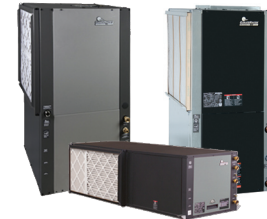
Commercial & Residential Geothermal Heat Pump Systems