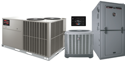
Residential & Commercial HVAC Equipment IAQ Products