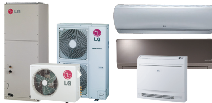
Mini Split Heat Pump Systems | AC PTAC | Flex Multi Systems